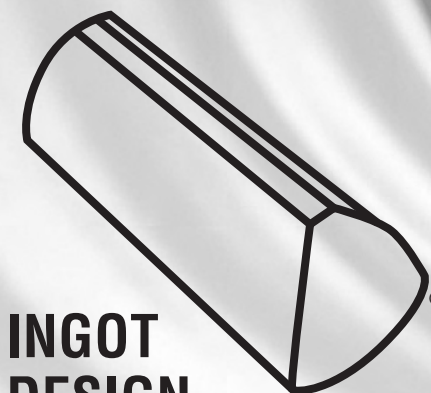
INGOT DESIGN BRIQUET

A SUSTAINED RELEASE PRODUCT TO PREVENT ADULT MOSQUITO EMERGENCE (INCLUDING THOSE WHICH MAY TRANSMIT WEST NILE VIRUS)